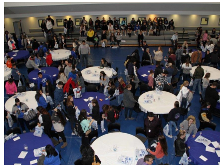
Native American High School Juniors and Seniors at the TCC College Achievement Summit.

Each student was provided a goody bag with TCC items in them. They were also provided Indian Tacos for lunch which everyone enjoyed.