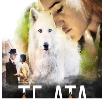
Te Ata Movie Poster

American stories passed down to her. The students enjoyed the movie and clapped at the end.