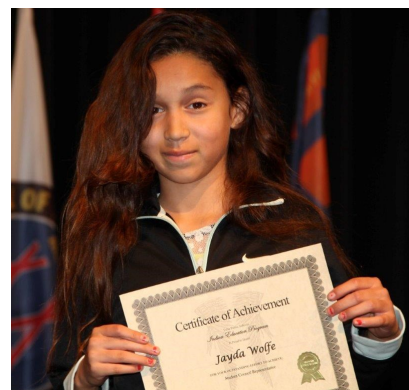
The 39th Annual Awards were held in the Clinton Middle School auditorium . Good work!