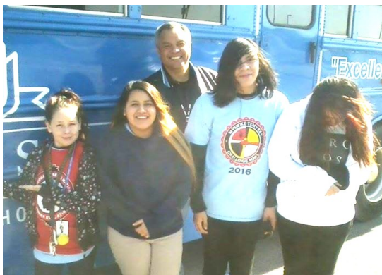
Memorial Jr High - YAHV (wolf) Team