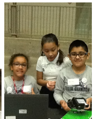
The Spring Botball Challenge was held at the Expo Square pavilion on Saturday, April 30, 2016.