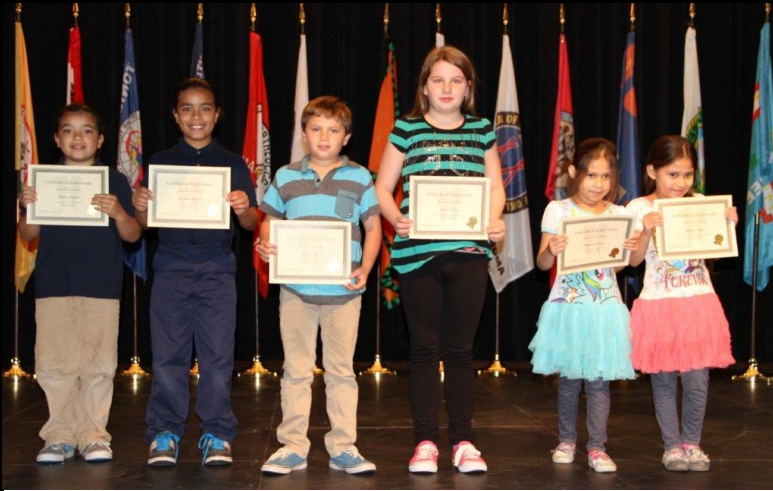
Annual Elementary Awards Night April 21, 2016