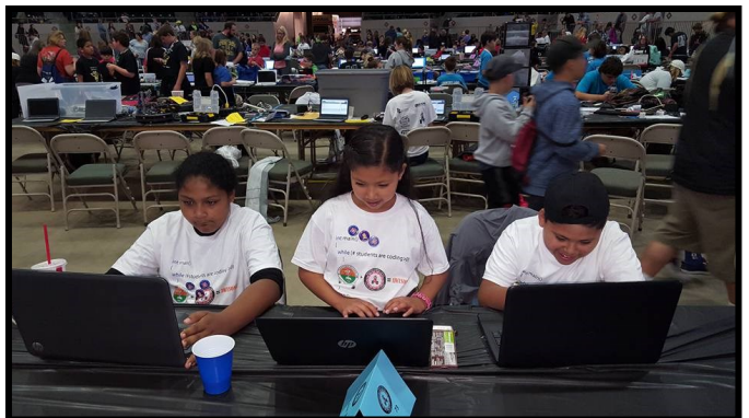
The Spring Botball Challenge was held at the Expo Square pavilion on Saturday, April 22 2017 .

The Challenge was held on April 22, 2017 at the Expo Square Pavilion for elementary teams representing seven Tulsa Public Schools. Eliot and Eisenhower International teams placed.