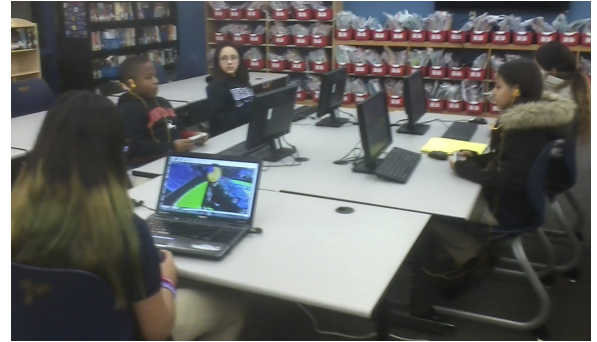
Lindbergh Elementary Muscogee Challenge Bowl Team prepares for the competition on February 17, 2017.

Middle school teams competed on February 10, 2017.