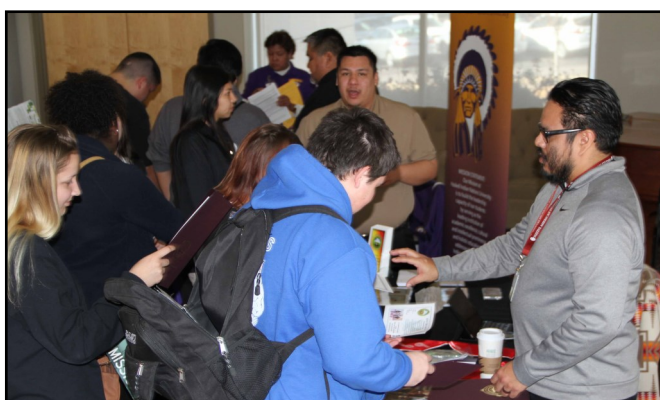
Indian Education, College and Career Fair In Tulsa at the OU-Schusterman Center.