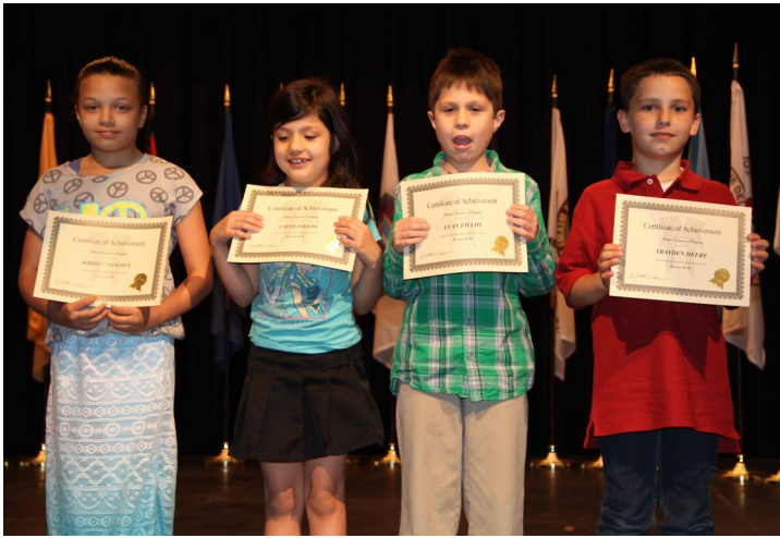
Annual Elementary Awards Night April 17 and 18, 2017.