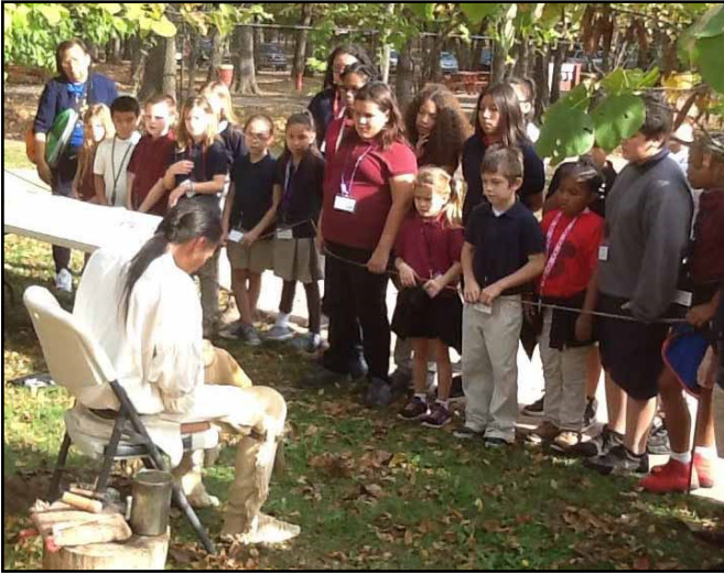
Disney Elementary students watch a Cherokee demonstration of flint knapping arrow heads in Tahlequah, OK. November 4, 2016