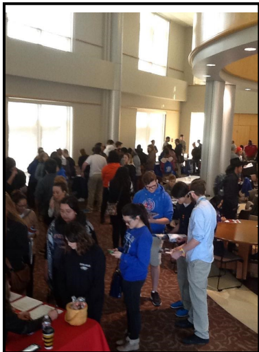
Tulsa Indian Education College and Career Fair January 25, 2017