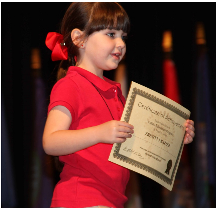
The 40th Annual Awards were held in the Clinton Middle School auditorium.