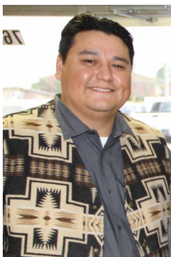
Chairman, Spotted Horse