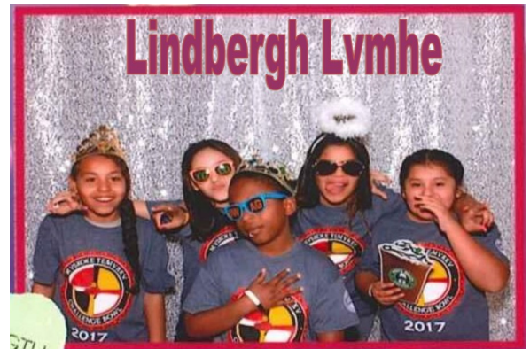
Team members take a break between competition rounds!