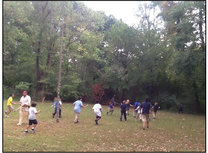
Springdale Elementary stickball game at Cherokee Complex, Tahlequah, OK. October 6, 2016